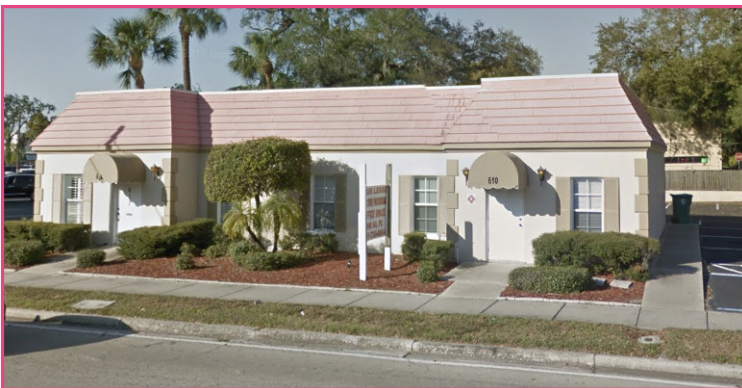
Healthy Start Coalition 612 7th Street West Palmetto, FL 34221

Effective August 1, 2018, Healthy Start Manatee will have a new home-- well, two new homes to be exact. The Healthy Start Coalition staff and Healthy Start Care Coordination team will now be housed in separate buildings. While this is a change for us locally, it is more in line with our Healthy Start colleagues statewide. As you can see from the addresses, the buildings are just a few short blocks from each other. You may have also noticed that our new addresses reflect a move to the Palmetto area; 34221 is a high need zip code, and we hope that this new central location will be more accessible for clients visiting our office. Both offices are located on active bus routes.