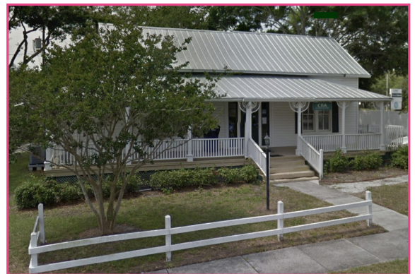
Healthy Start Care Coordination 715 4th Street West Palmetto, FL 34221